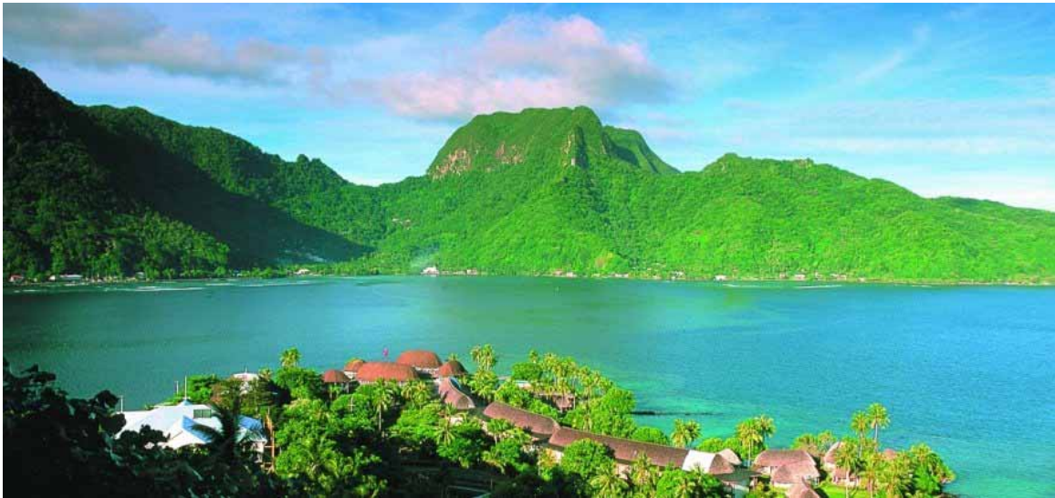
Pago Pago Bay