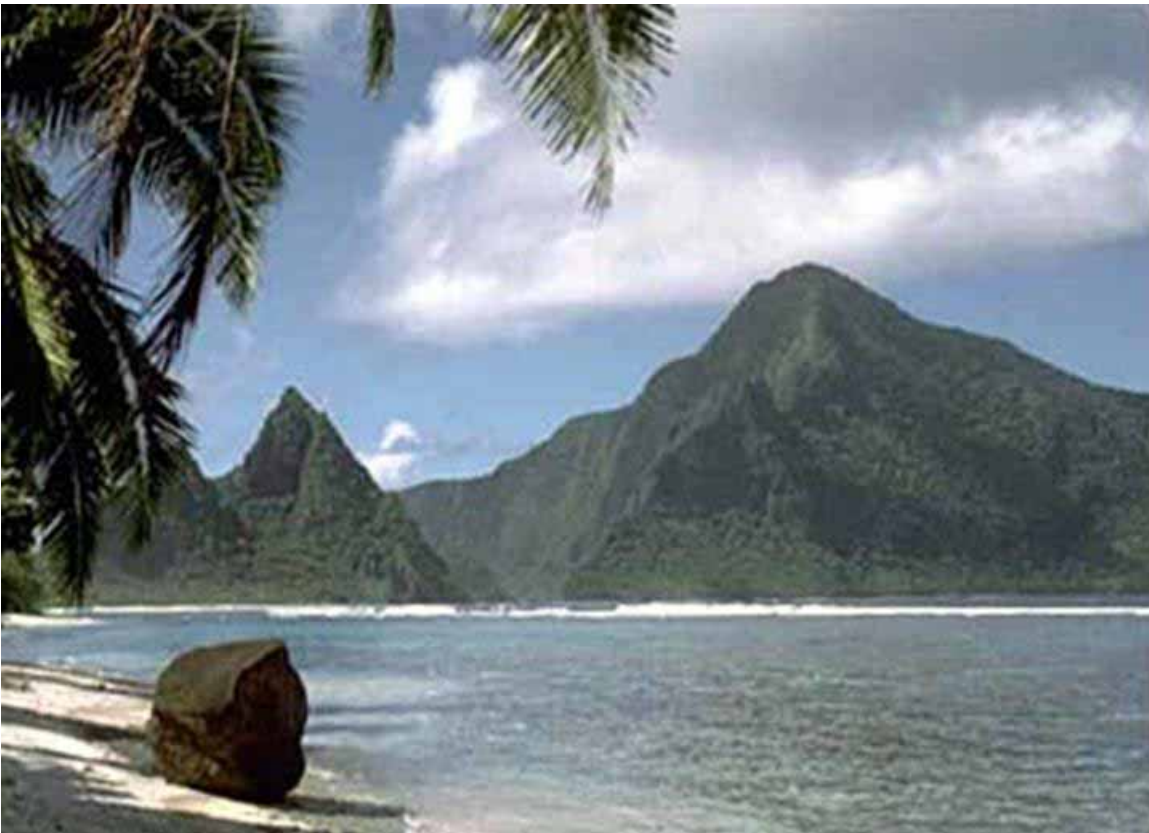
Ofu Island, National Park of American Samoa, Photo: Chris Stein

The territory is home to one of the newest U.S. National Parks and the only one in the southern hemisphere. Spread across sections of the three picturesque islands of Tutuila, Ofu and Ta'u, the park preserves the only mixed-species paleotropical rainforest in the United States, habitat of rare flying foxes, and Indo-Pacific coral reefs. Most of the 10,500-acre park encompassing the volcanic land area from the tops of the mountains to the ocean is rainforest. Approximately 2,500 acres of the park is underwater, including some of the most beautiful and pristine coral reefs in the South Pacific.