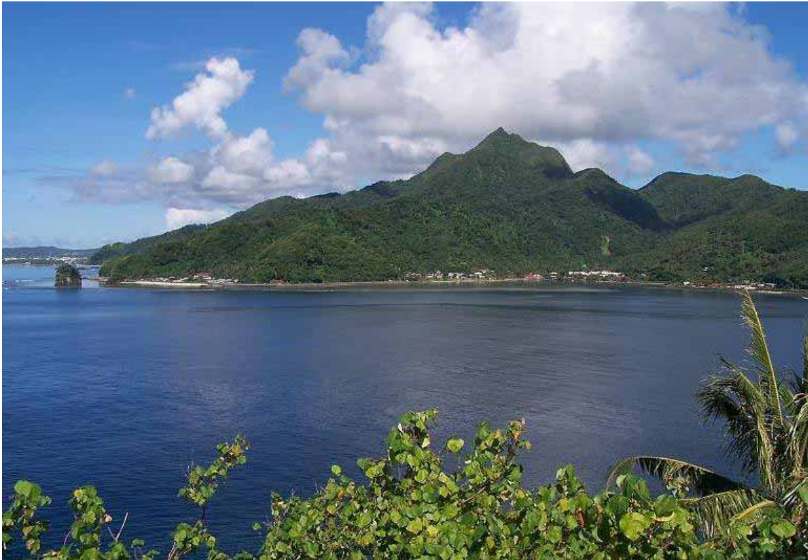
Mt. Matafao

At 653 meters (2,142 ft.) this is Tutuila Island's highest peak, and can be traversed in half a day. The trailhead begins directly opposite of the Mt. Alava trail. To access the main trail, climb the white metal ladder up to the ridge south of the road. The hike is about three hours long, through a tranquil rainforest. Caution is advised, and it is safest to stay on the ridge for the entirety of the hike. Avoid hiking in rainy weather, as the trails can become slippery and dangerous.