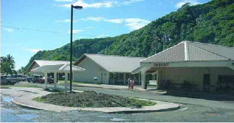
LBJ Tropical Medical Center, Source: http://www.samoanet.com