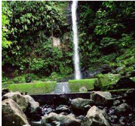
Leone Falls

There is a road next to the Catholic Church which leads 1.5 miles to the refreshing Leone Falls. At the base of the falls is a freshwater pool which is ideal for swimming. Due to religious observances, the falls are closed on Sundays.