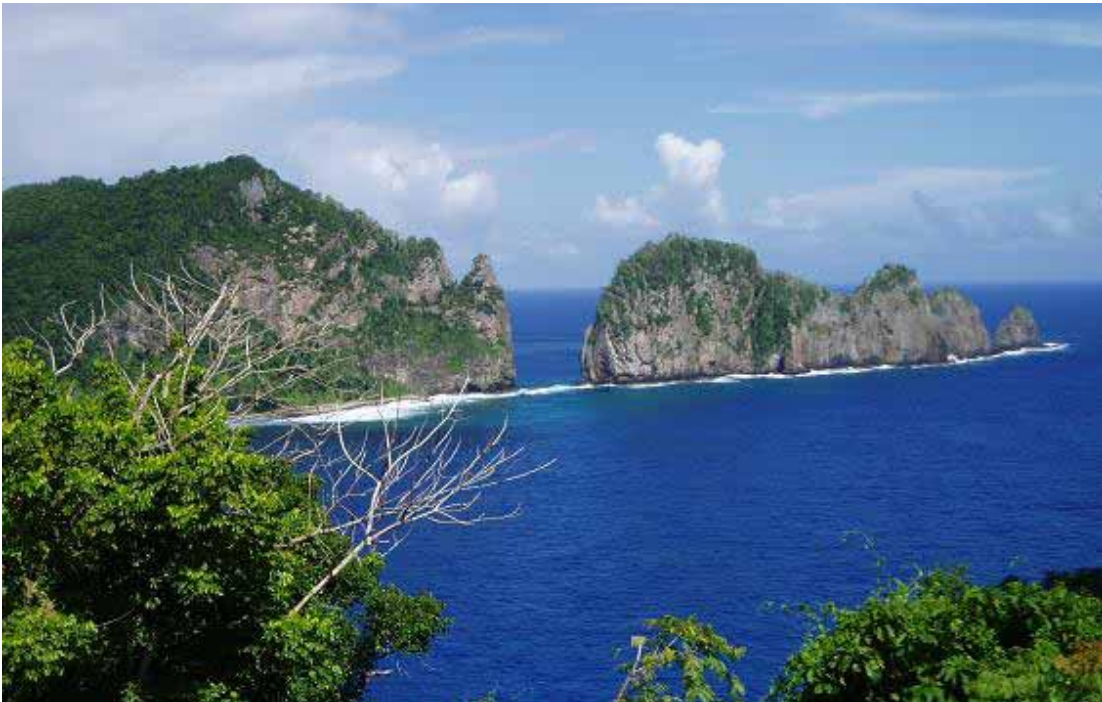
Pola Island

Part of the National Park of American Samoa on the island of Tutuila, Pola Island (also known as Cockscomb ) is known for its sheer 100 foot cliffs and wheeling seabirds. In the past, villagers would scale the cliffs (without climbing equipment) to hunt the nesting seabirds. This beautiful natural attraction located on the western end of Vatia Bay is the most significant nesting area for seabirds in American Samoa.