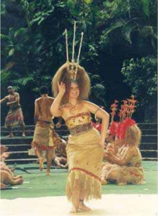
Samoan Dance

The interwoven threads of family, church, village and respect are tightly sewn into the fabric of the Samoan culture, which has survived for 3,000 years. The introduction of Christianity had a profound impact on Samoan culture and people, who remain deeply religious to this day. The colorful variety of hand-woven baskets, fans and mats, skillful wood carvings and the fine art of siapo (tapa cloth) are positive indicators that the Samoan culture remains strong and vibrant. However, it is the lavish fiafia performances, which include traditional siva dances to the synchronized rhythm of drums, vocals, and musical instruments, followed by the energetic fire-knife dances that often generate the most delightful and intoxicating form of cultural entertainment, leaving the spectator with a profound sense of awe and taste of Polynesia at its finest.