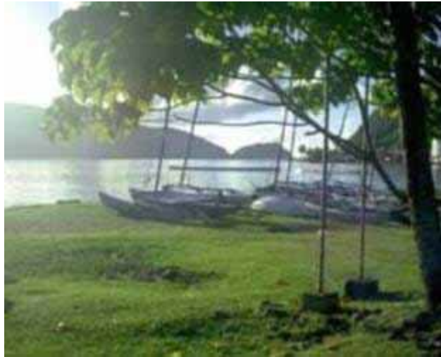
Pago Pago Yacht Club

One of the few remaining historical buildings for public use in Utulei is the Pago Pago Yacht Club in Utulei Beach Park. Next to the building, the Canoe Club built a canoe shed which is used as a landing and storage area for Samoan racing canoes. The Yacht Club is the center of water sports in American Samoa, offering outrigger canoeing, game fishing, sailing, swimming and diving. It also serves as a quaint harbor-side retreat which is nice for relaxing conversation, lunch and a cocktail or three. The Yacht Club is a member of both the International Yacht Racing Unit and the American Samoa National Olympic Committee.