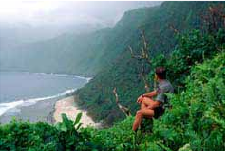
Ta'u Island

The National Park in Ta'u includes the beaches and forests in the south-eastern half of the island. When given advance notice, Park Service staff can arrange guided hikes, including a six hour hike from Ta'u Village to Judds Crater, a large volcanic crater that includes the beaches and forests in the south-eastern half of the island.