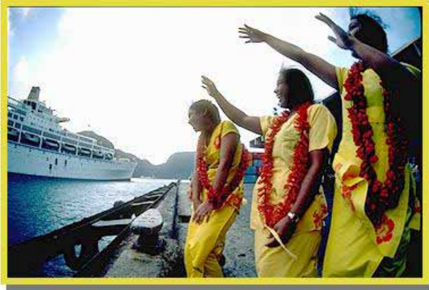
Cruise ship in Pago Pago Harbor