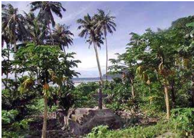
Massacre Bay, Source: http://www.tamug.edu/samoa

North Shore Tours also runs excursions to this scenic and historic site.