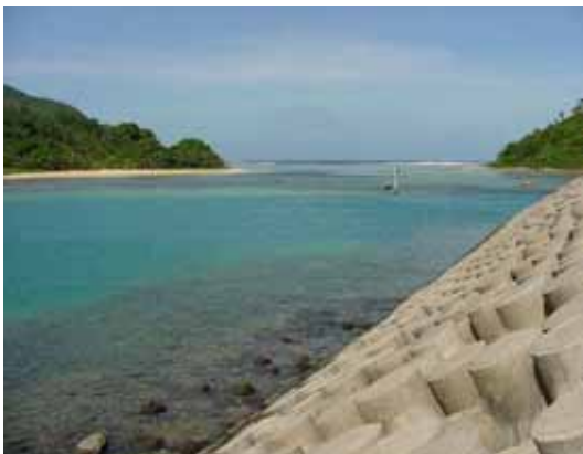
Revetment at Ofu Harbor