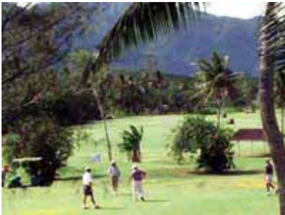
Ili’ili Golf Course

Tee times are not necessary, though it is advised to make reservations for cart and clubs as supplies are limited.