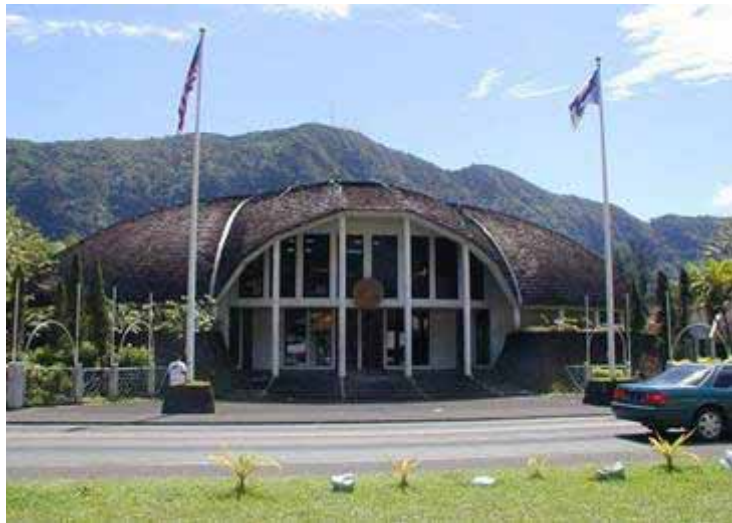
Legislative Building,

American Samoa is the only populated island group under the U.S. flag south of the equator. Based on the U.S. model of government and U.S. currency, the territory is recognized as a safe and stable environment for the potential business partner as well as the leisure traveler. As an unincorporated and unorganized territory of the United States of America, not all provisions of the U.S. Constitution apply to American Samoa. Those born in American Samoa are not U.S. citizens; rather, they are U.S. nationals who can freely enter the United States to work and reside. American Samoa also has its own immigration laws. In contrast to the U.S. insular area of Guam, where U.S. immigration laws apply, entry into American Samoa by foreigners does not constitute entry into the U.S.