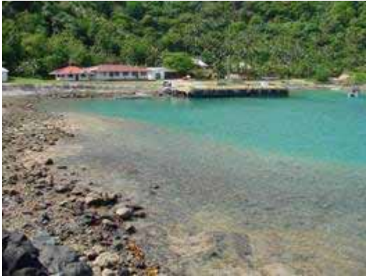
Ofu Harbor, Source: Ofu Website