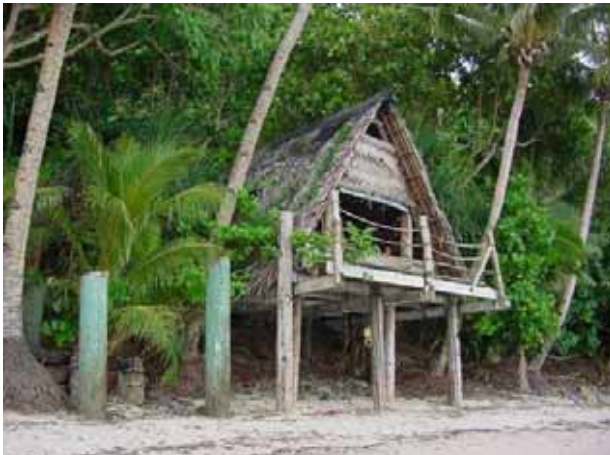
Tisa's Guest Fale

The traditional fale , which sleeps up to four persons, is an eco-tour experience in itself. The high thatched roof keeps the heat away by day, and the mosquito netting keeps insects away by night. The kava deck faces the beach and is the perfect place to relax and watch the sunset. US$50 per night includes accommodations, tropical (communal) showers and bathrooms, breakfast and dinner.