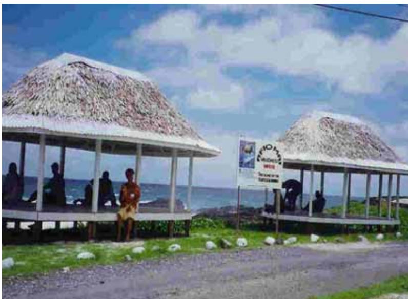
Turtle and Shark Site, Photo courtesy of Juanita Liu

The most famous legend of Tutuila is found along the black lava coast of Vaitogi village. Though there are many different versions of the legend, one of the most popular relates the story of a blind lady and her granddaughter, who during an extreme time of hardship and starvation and after being turned away from other villagers, leapt from the cliffs into the ocean in order to avoid starvation. Magically, they turned into the turtle and the shark.